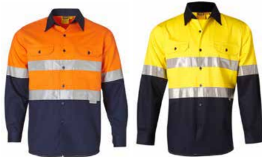
Fluoro Orange/ Navy