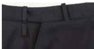
SMALL COIN POCKET & KEY HANGER ON BELT LOOP.